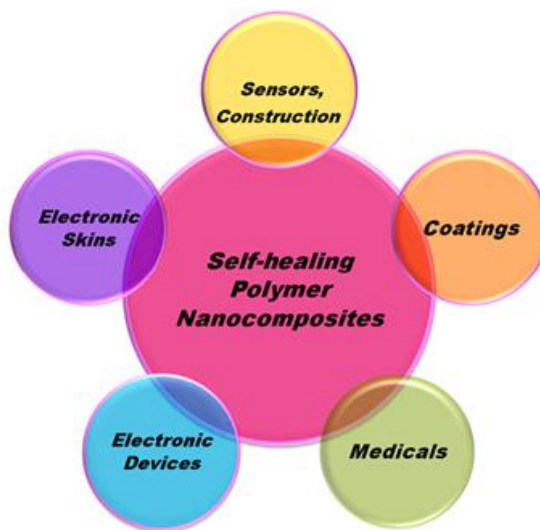
Figure 2: Various applications of self-treatment nanocomposites made of polymers [16].

Researchers are exploring new nanomaterials that can enhance the durability and efficiency of renewable energy systems. This includes the development of self-healing materials and coatings that can extend the lifespan of solar panels and wind turbines [16].